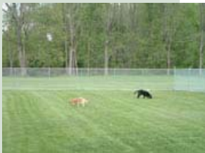
Your pet will visit our huge play yards for hours each day!

It’s what makes a Little River vacation a unique experience—something your pet will look forward to!