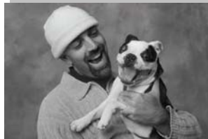
Your pet deserves the best!

We have made a deal with our companion animals. In return for all of their love and companionship, we provide for their physical needs, mental stimulation, and emotional care. You are committed to meeting these needs & Little River is your partner.