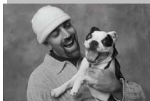
Your pet deserves the best!

As pet owners, we have made a deal with our companion animals. In return for all of their love and companionship, we provide for their physical needs, mental stimulation, and emotional care. Little River is your partner in meeting those needs.