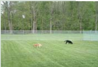
Your pet will visit our huge Play Areas 7 times each day!

In addition to seven daily playtimes, (included in the daily rate), you can decide how your pet will spend his days by choosing from our activities menu. For example, schedule a vigorous hike around our property, thirty minutes of chasing a ball or frisbee, or just some relaxing cuddle time!